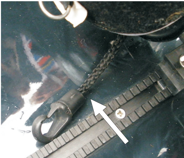
Sculler Capsize String appeared to pull out of fitting during sculling boat capsized