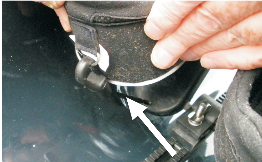
Clip Fitted Incorrectly Opening is towards the shoe and clip may become detached